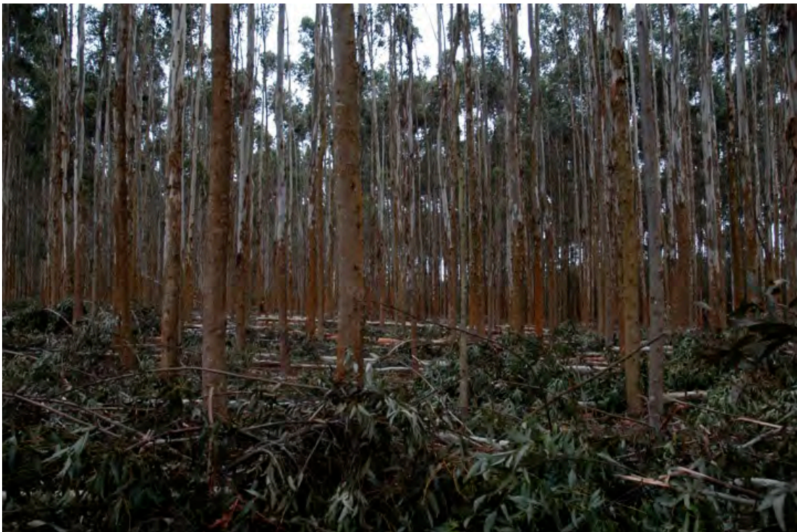
Images 10 & 11: Examples of Pinus plantations (4 years since planting, 29.3.12) and Eucalyptus (8 years since planting, in the process of the first selective harvesting for transmission poles, 30.3.12)