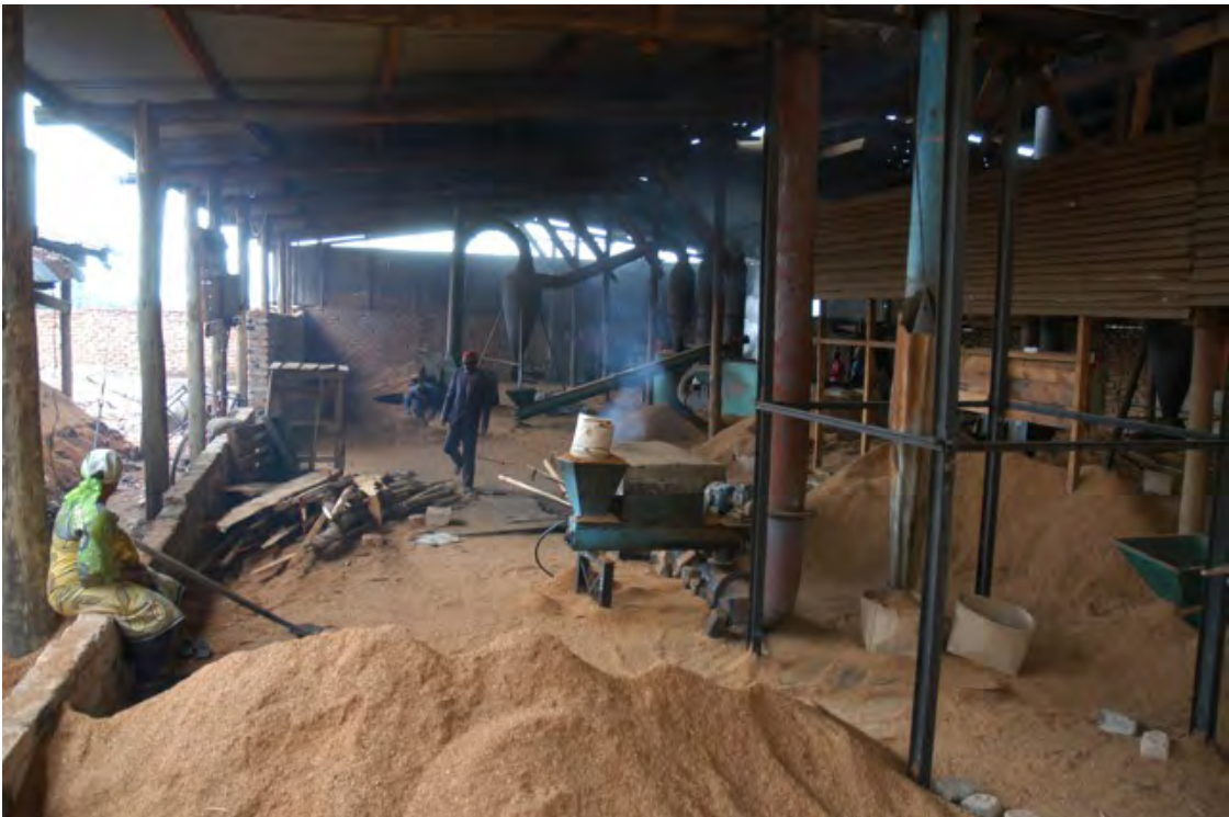
Images 19 & 20: Current mode of operation of local saw mills. This technology level should be phased out according to plans of the national government and replaced by modernised saw mills (above). The saw mill of Mena Wood Co. Ltd in Mafinga established a pioneering venture into the production of wood briquettes out of residual saw dust (below).