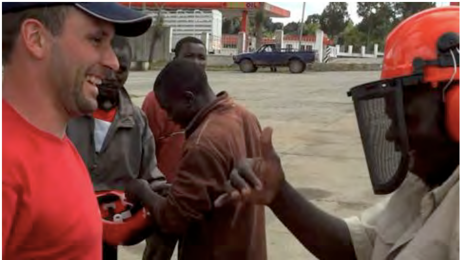
Images 3, 4 & 5: Introduction about use, maintenance and safety (19.4.2012).