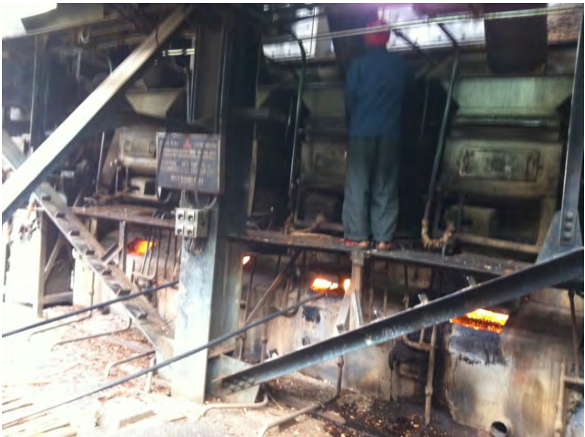
Images 14 & 15: The existing 10 MW steam turbine at Mufindi Paper Mill (27.3.12)