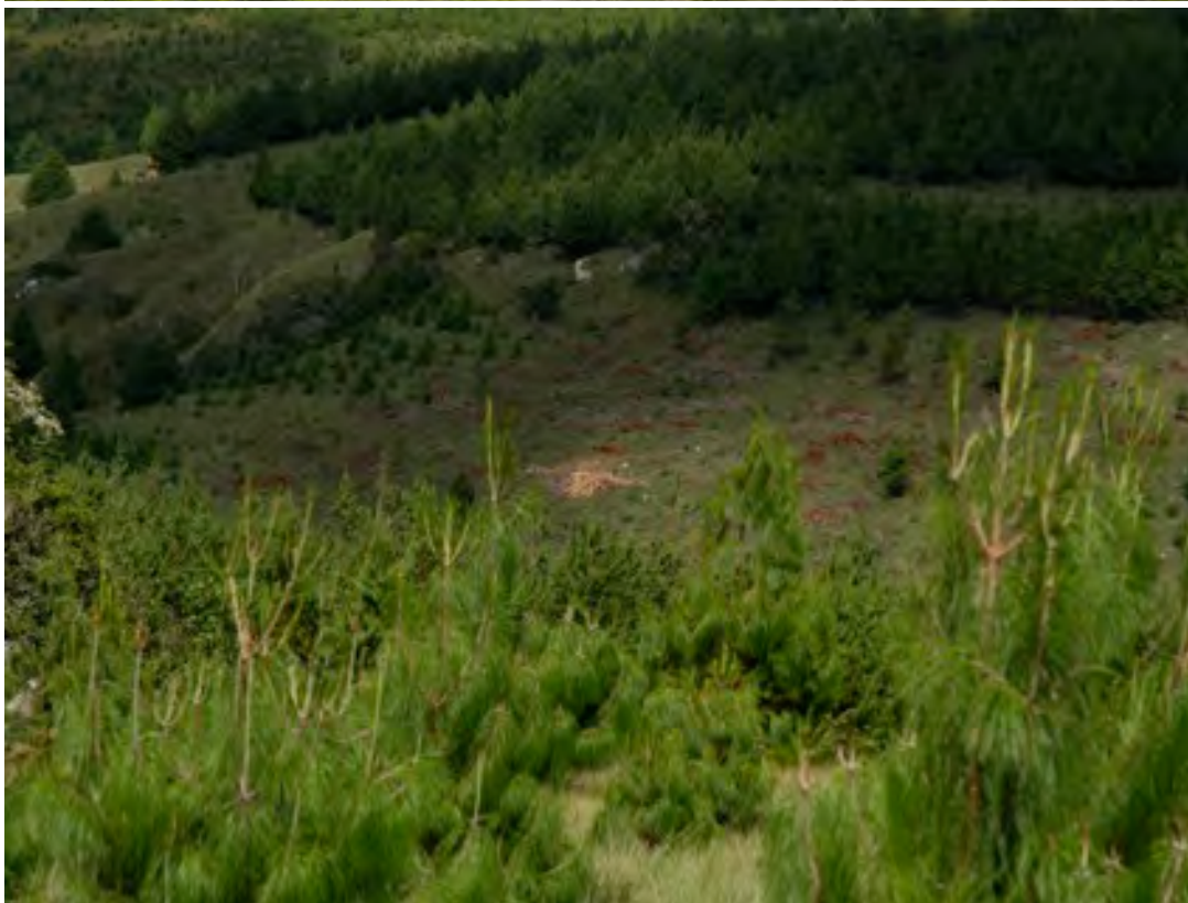
Images 7 & 8: Examples of Pinus plantations in the government managed Sao Hill Forest Reserve (above, 26.3.12) and by private farmers in Lupembe village (below, 29.3.12)