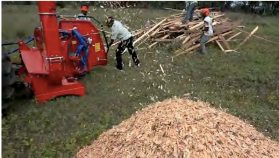
Image 6: Test run at local sawing lot in the area of Mafinga (20.4.2012)