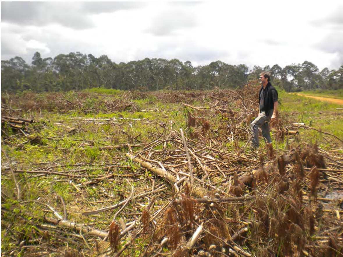
Images 12 & 13: Offcuts and sawdust at Kalinga sawing lot set aside during a period of 6 months (above, 26.3.12), harvesting residues left to be burned on newly harvested lot (below, 26.3.12)